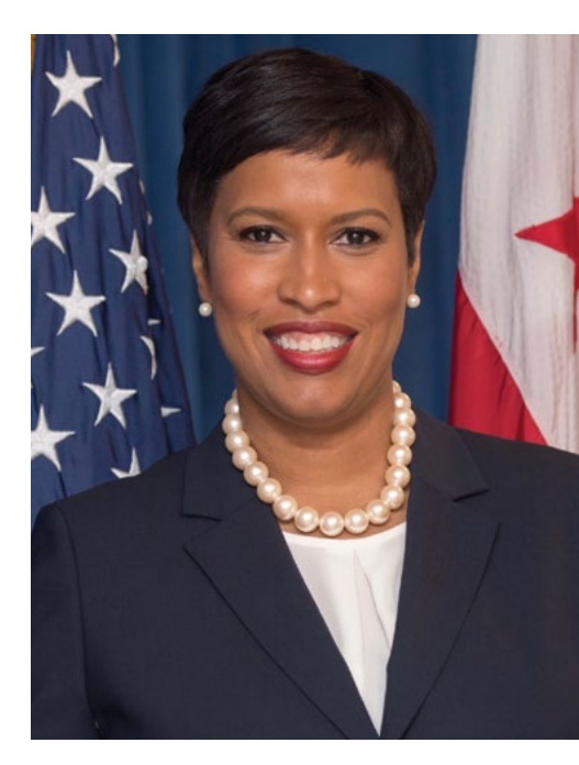
Muriel Bowser Mayor, Washington, DC

On behalf of the nearly 700,000 residents of Washington, DC, I congratulate you on your accomplishment. May success follow you always.